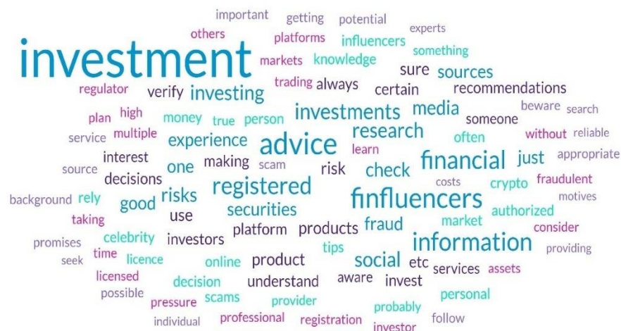
Figure 4. Common words on finfluencer-related educational messaging for retail investors

In Figure 4, a word cloud features the most common words regulators used in their survey responses in their educational messaging about finfluencers (note that larger words indicate higher reporting frequency).